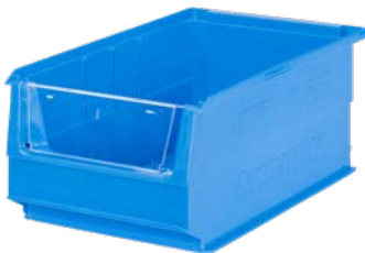
SB SS screen