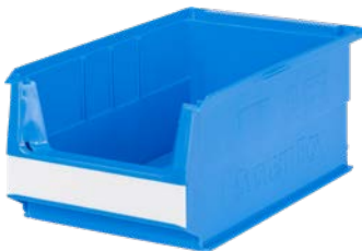
SB ET labels