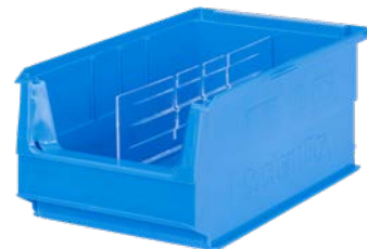
SB LT length divider*