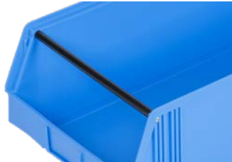
Carrying bar, permanently fitted for more stability