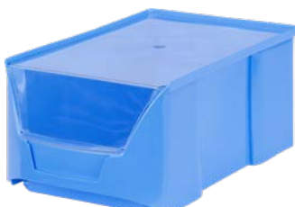
FA D dust lid