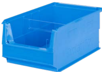
SB QT cross divider*