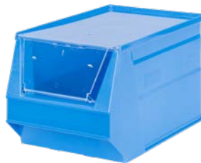
SB D lid + SB SS screen = dust protection