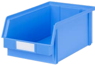
CB ET labels