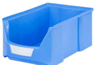
FA ET label