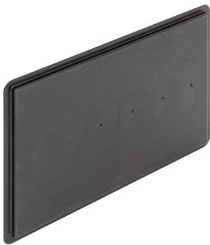
Flat base 007