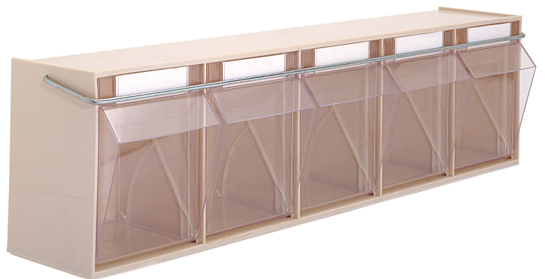
ST TRP safety bracked (prevents the boxes from opening)