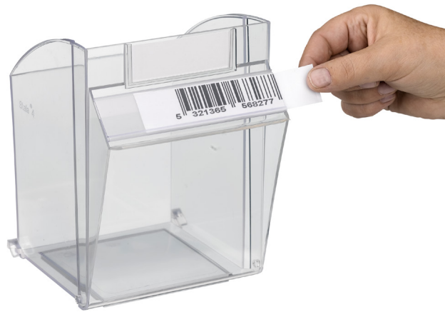
ST SC scanner plate