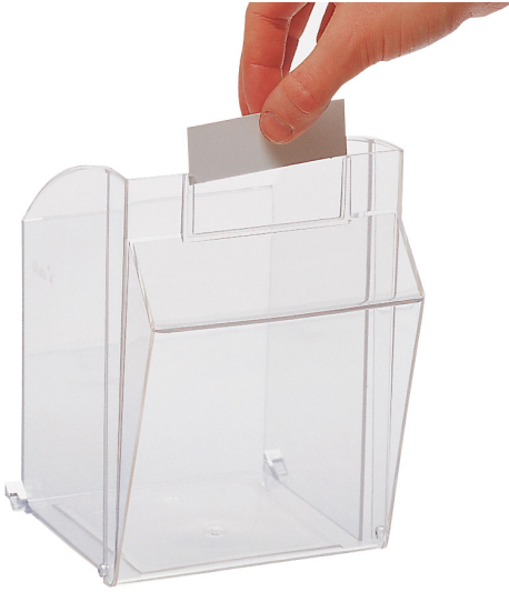
ST ET label