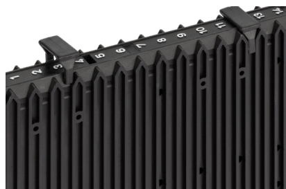
Figure showing slot lock

The adjusting slot is marked with a rhombus and can be found at each end of the slot wall. It is 0.25 mm shallower than all other slots. Simply clamp the printed circuit board in the slot wall, screw the slot wall and aluminium profile, and you have already set the insertion dimension perfectly.