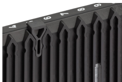
Figure showing slot lock

The adjusting slot is marked with a rhombus and can be found at each end of the slot wall. It is 0.25 mm shallower than all other slots. Simply clamp the printed circuit board in the slot wall, screw the slot wall and aluminium profile, and you have already set the insertion dimension perfectly.